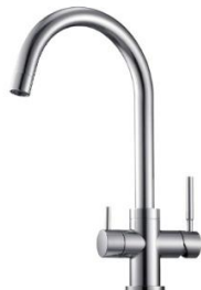
Stainless Steel HL