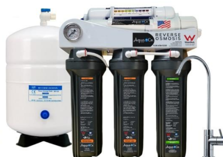
USA Reverse Osmosis System