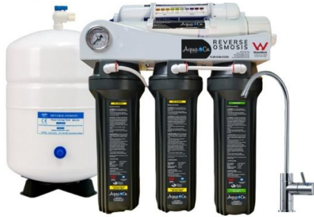
AquaCo Reverse Osmosis System

Our reverse osmosis systems produce alkaline and mineralised drinking water (Bottled-like Water).